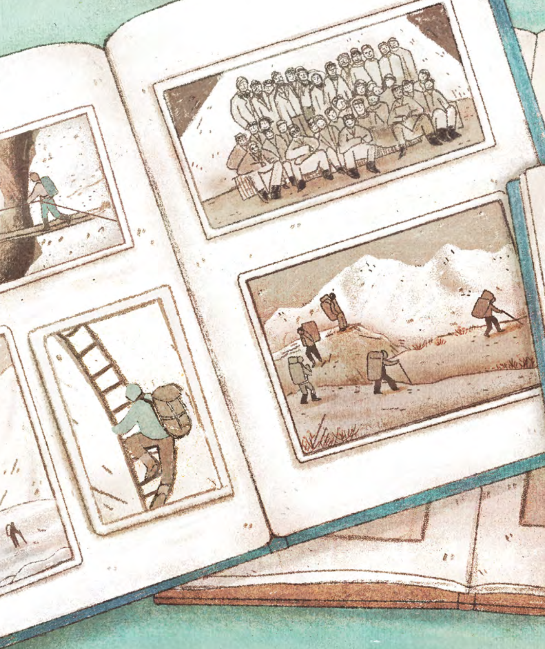
For nearly 20 years, Tenzing climbed many mountains.